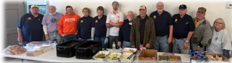
(Ya know, I may have misspoken. THIS is your Motley Crew .

staff of flippers, tongers, slicers, and servers snapped into action once again and fed that motley crew.